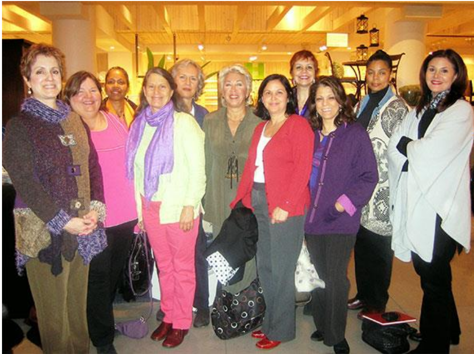
On March 25, 2007 ten IFSG members graduated from The School of Graceful Lifestyles Feng Shui Interior Redesign™ 5 Day Certificate Course. It was a success in more ways than one