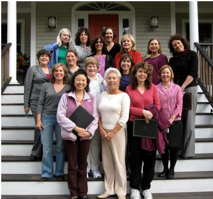
New England School of Feng Shui Alumni